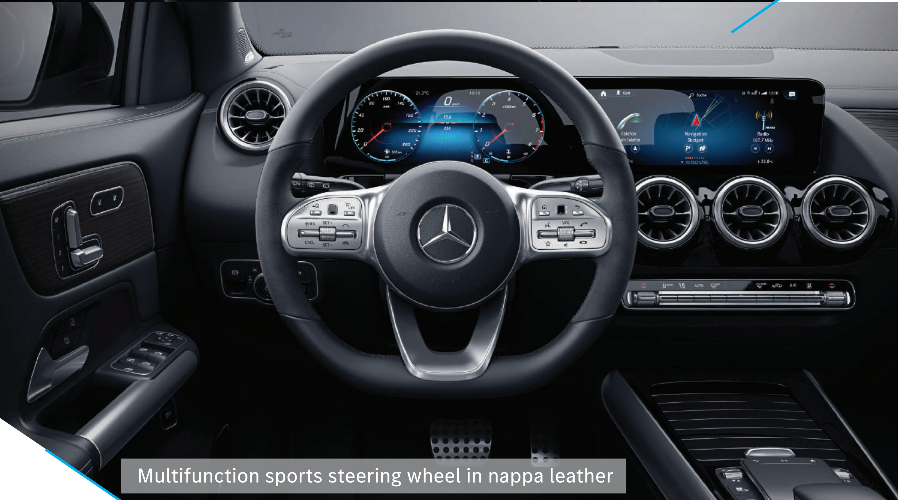
Multifunction sports steering wheel in nappa leather